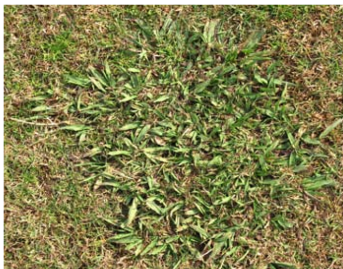
Figure 1. Dallisgrass is a clumping, perennial grassy weed.

(Figure 3). Hairy spikelets are arranged in four rows on 3-7 alternating branches (Figure 4). Dallisgrass will begin to produce seed as early as mid-June in Tennessee. Once used exclusively as a forage, dallisgrass is now a weed problem on lawns, golf courses and other turf areas statewide.