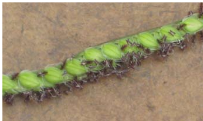
Figure 4. Dallisgrass seedhead