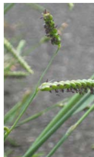
Figure 3. Hairs protruding from dallisgrass spikelet