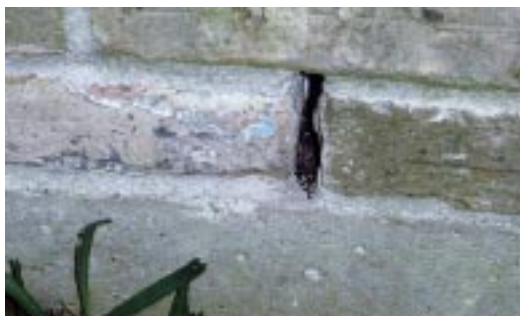
Exterior entry points

Tri-Die can be used in both residential and commercial environments. In wall voids and cracks and crevices, Tri-Die's light weight dust particles will penetrate deep into hard-to-reach harborage areas and entry points to insure kill, repellency and, most importantly, exclusion.