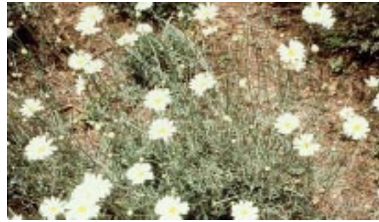
Chrysanthemums in Kenya, Africa

Strategy: Flushing, repellency, knockdown